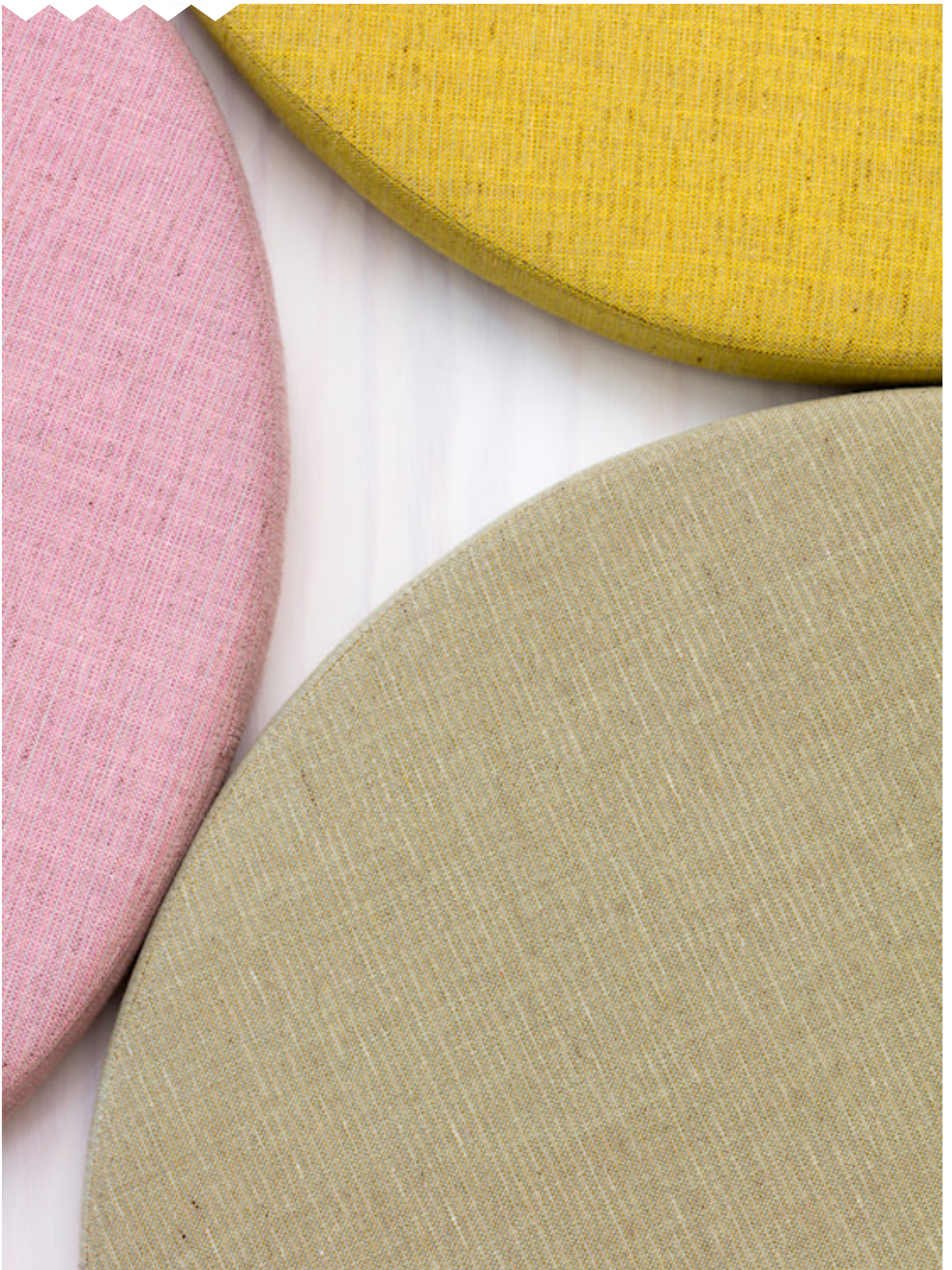
HARPER Upholstery fabrics