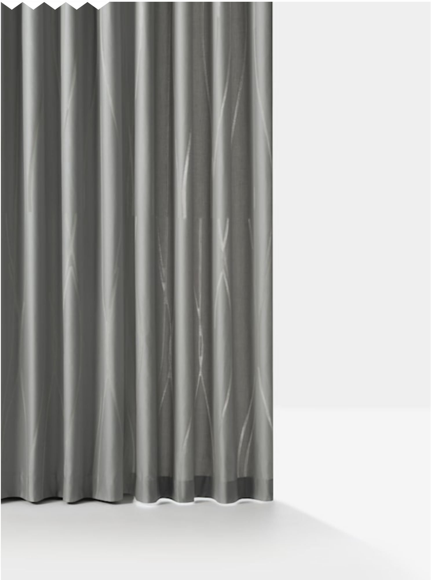
PRISM Hanging fabrics