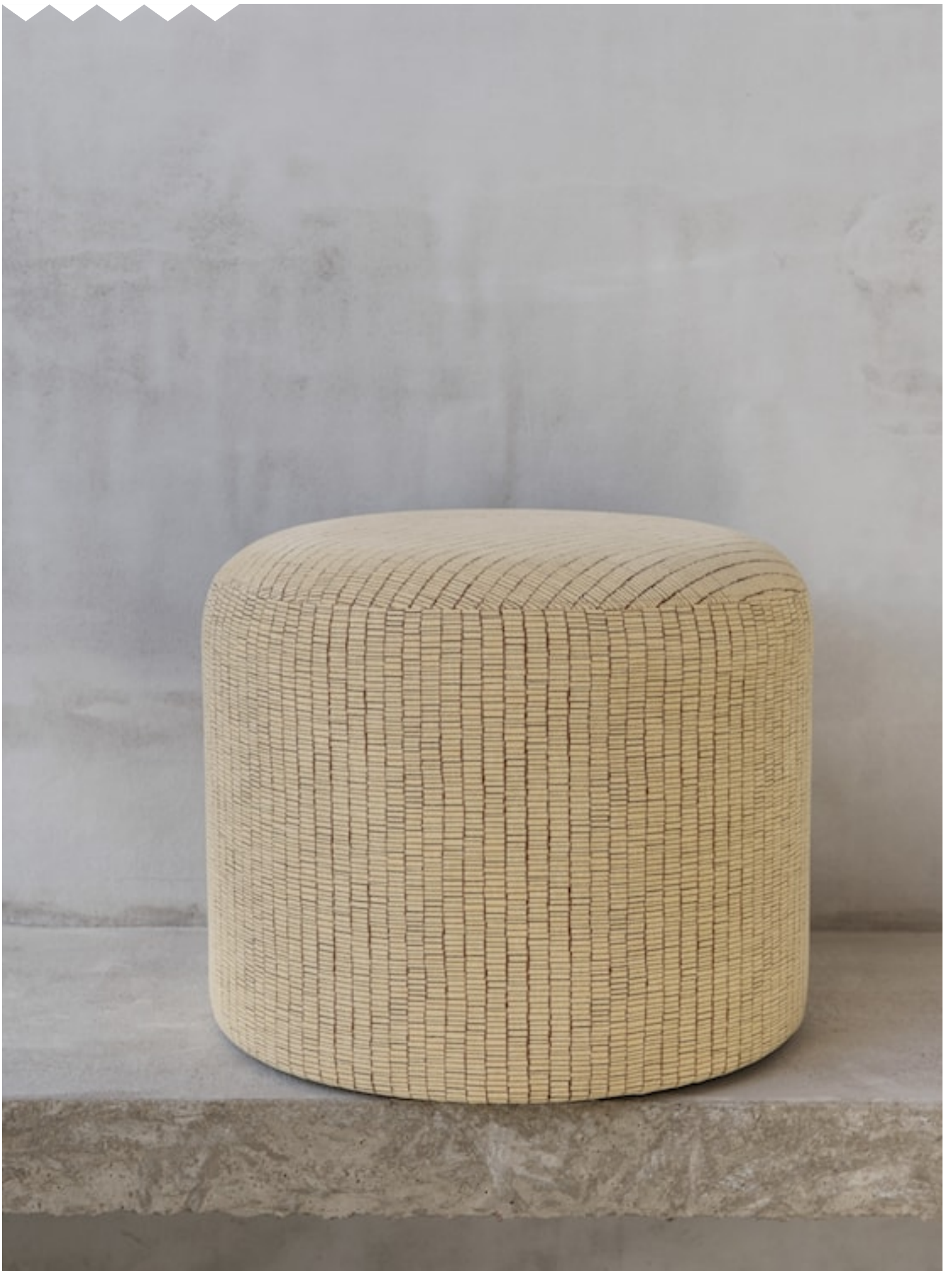
VELVET POCKET Upholstery fabrics