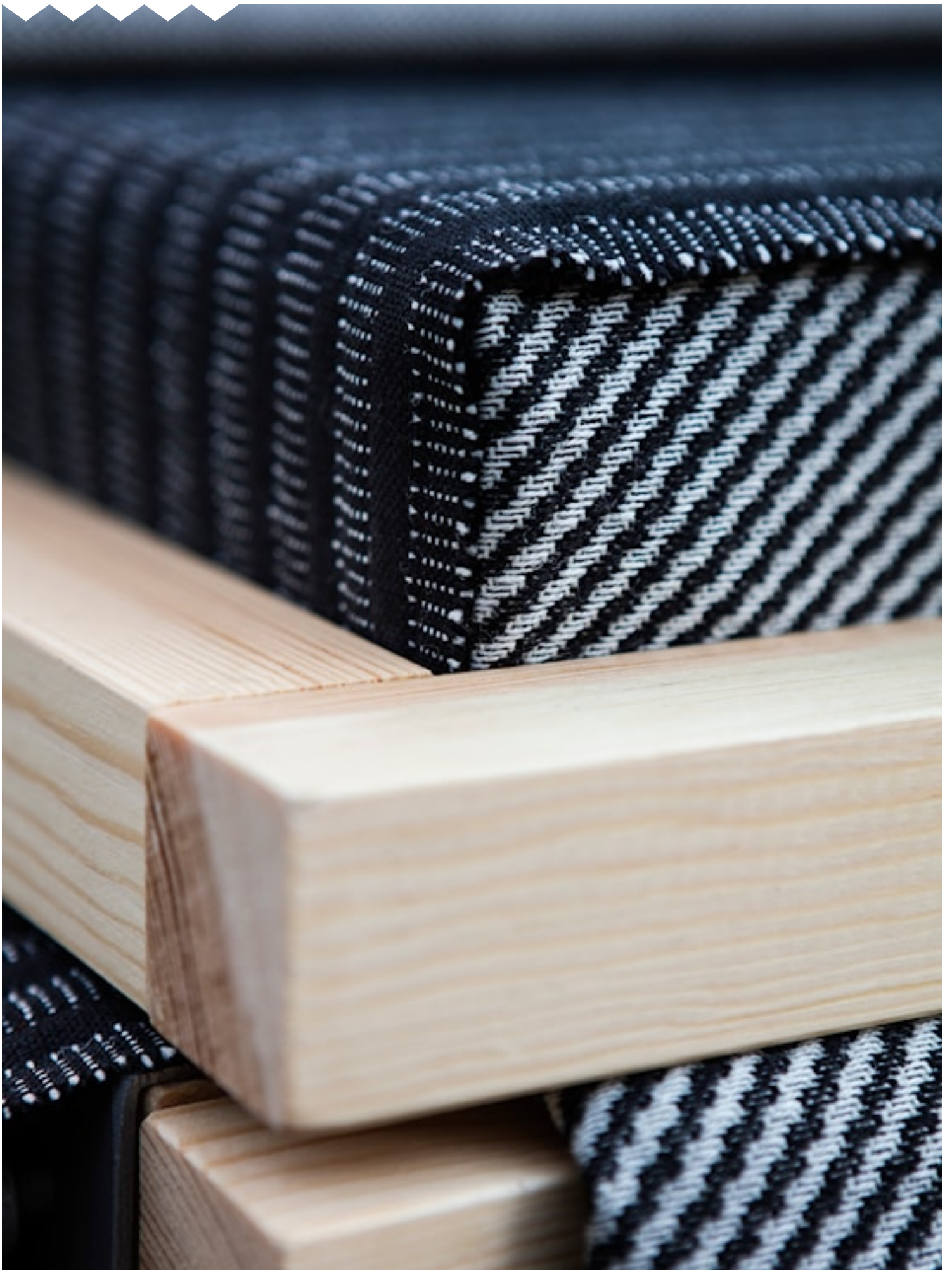
HERITAGE PELO Upholstery fabrics