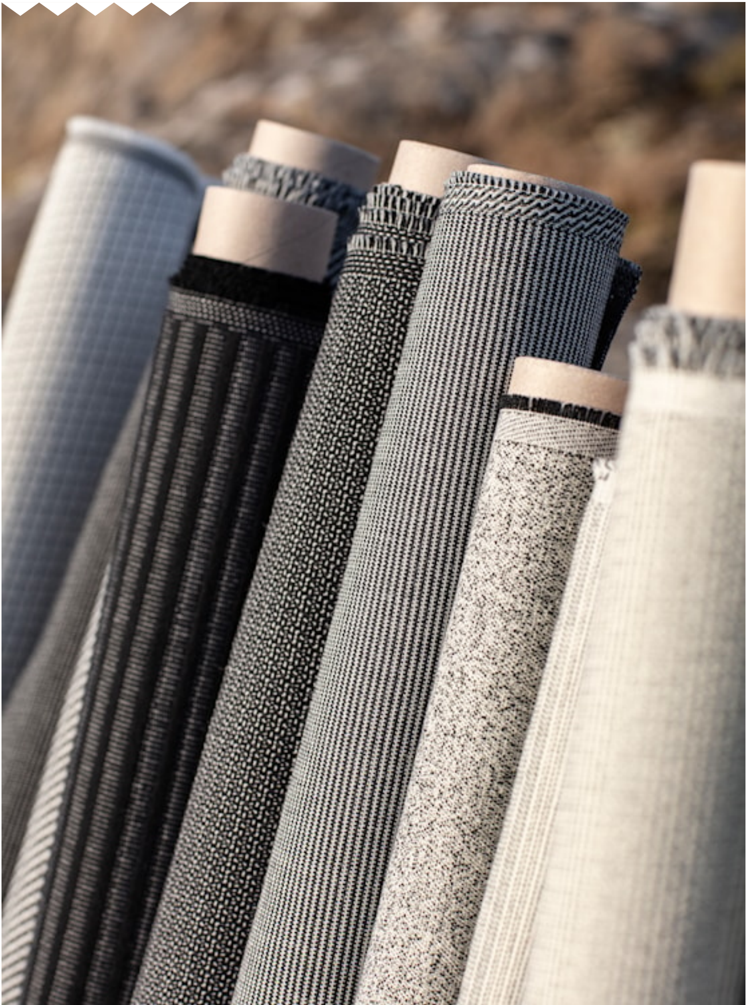
HERITAGE KIPPER Upholstery fabrics