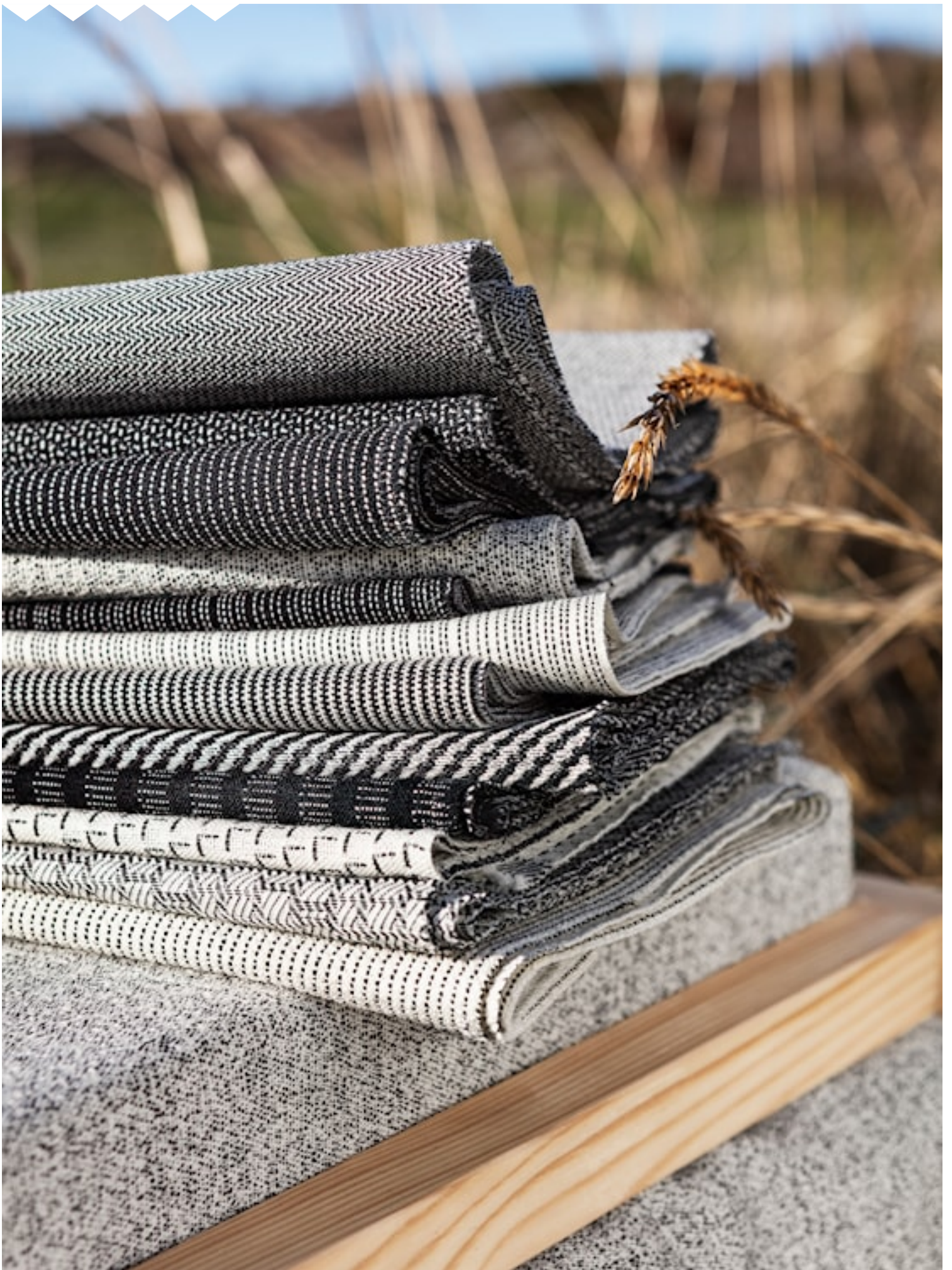
HERITAGE BOTANY Upholstery fabrics