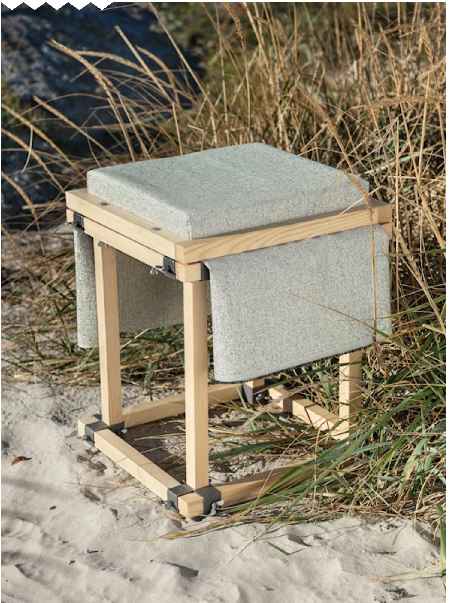
HERITAGE BLEND Upholstery fabrics