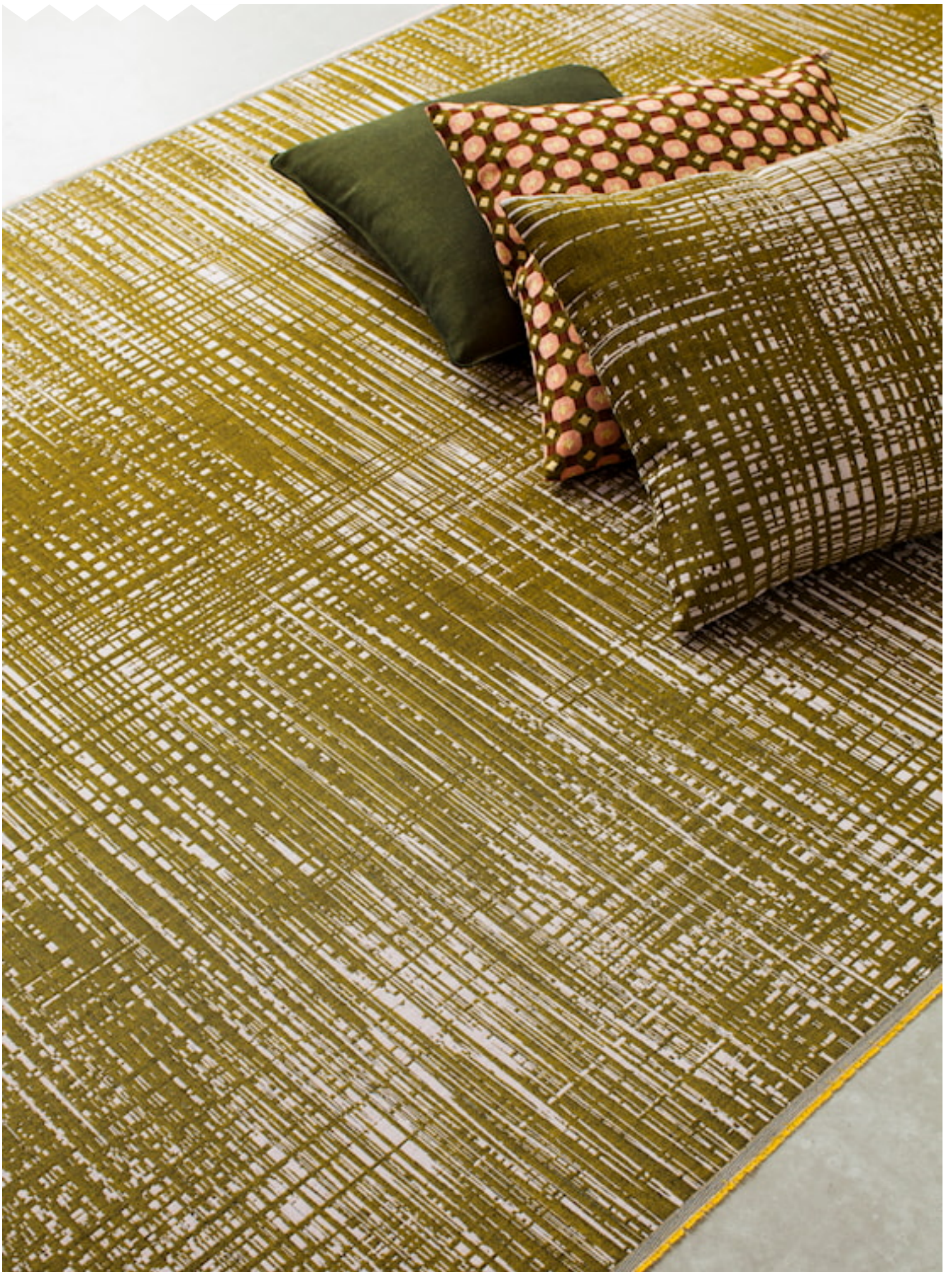
ACCESSOIRE SILK Upholstery fabrics