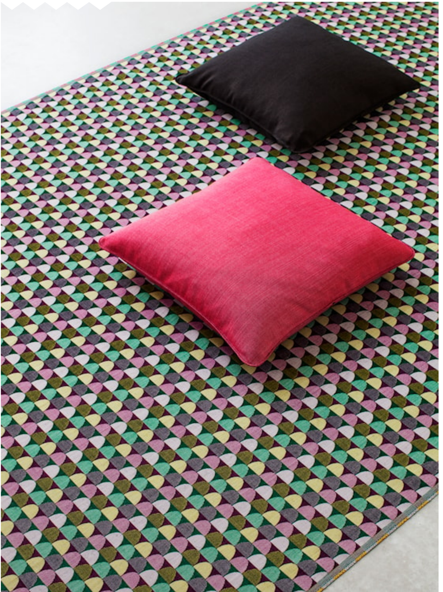
ACCESSOIRE POP Upholstery fabrics