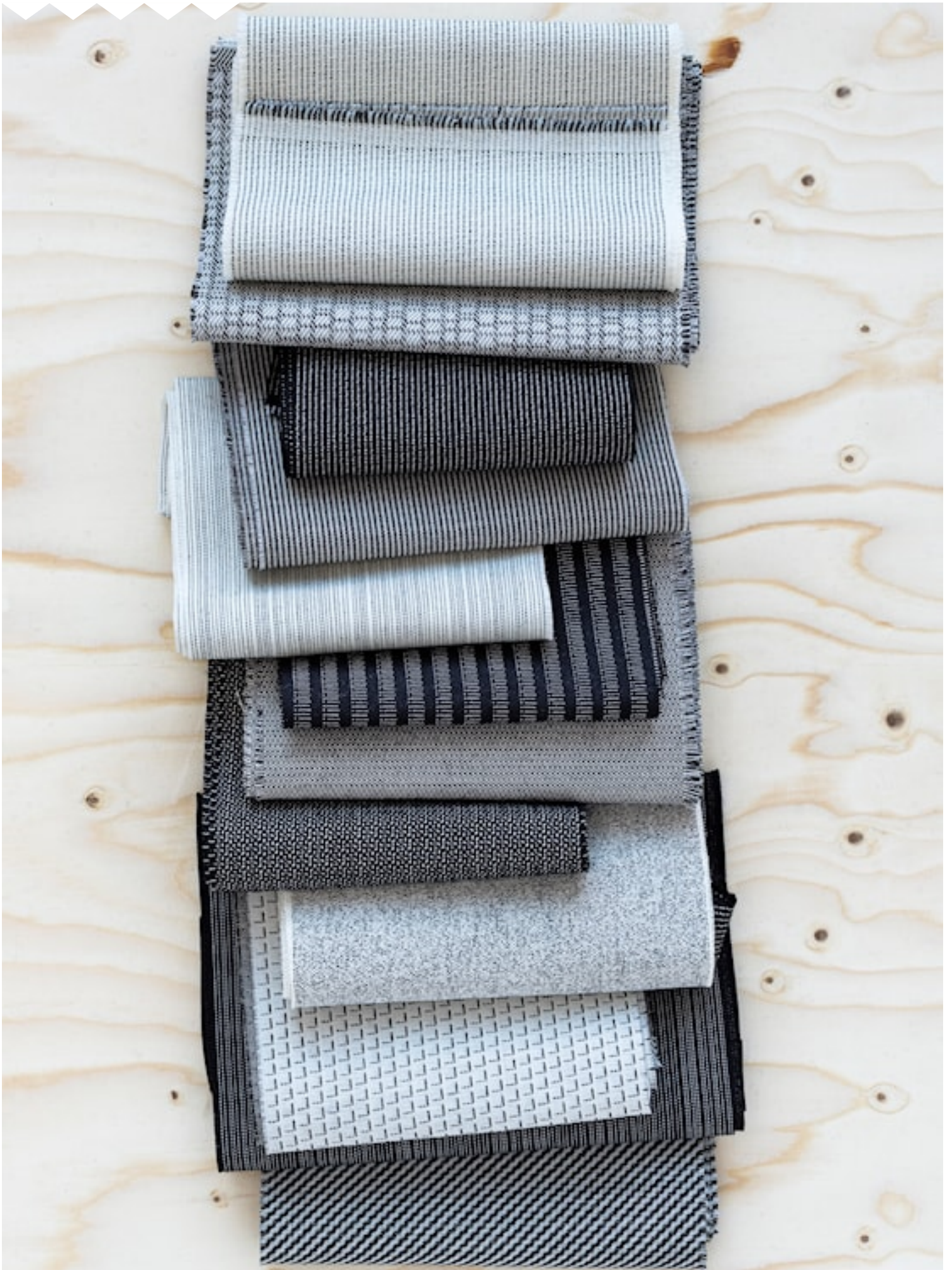
HERITAGE TAILOR Upholstery fabrics