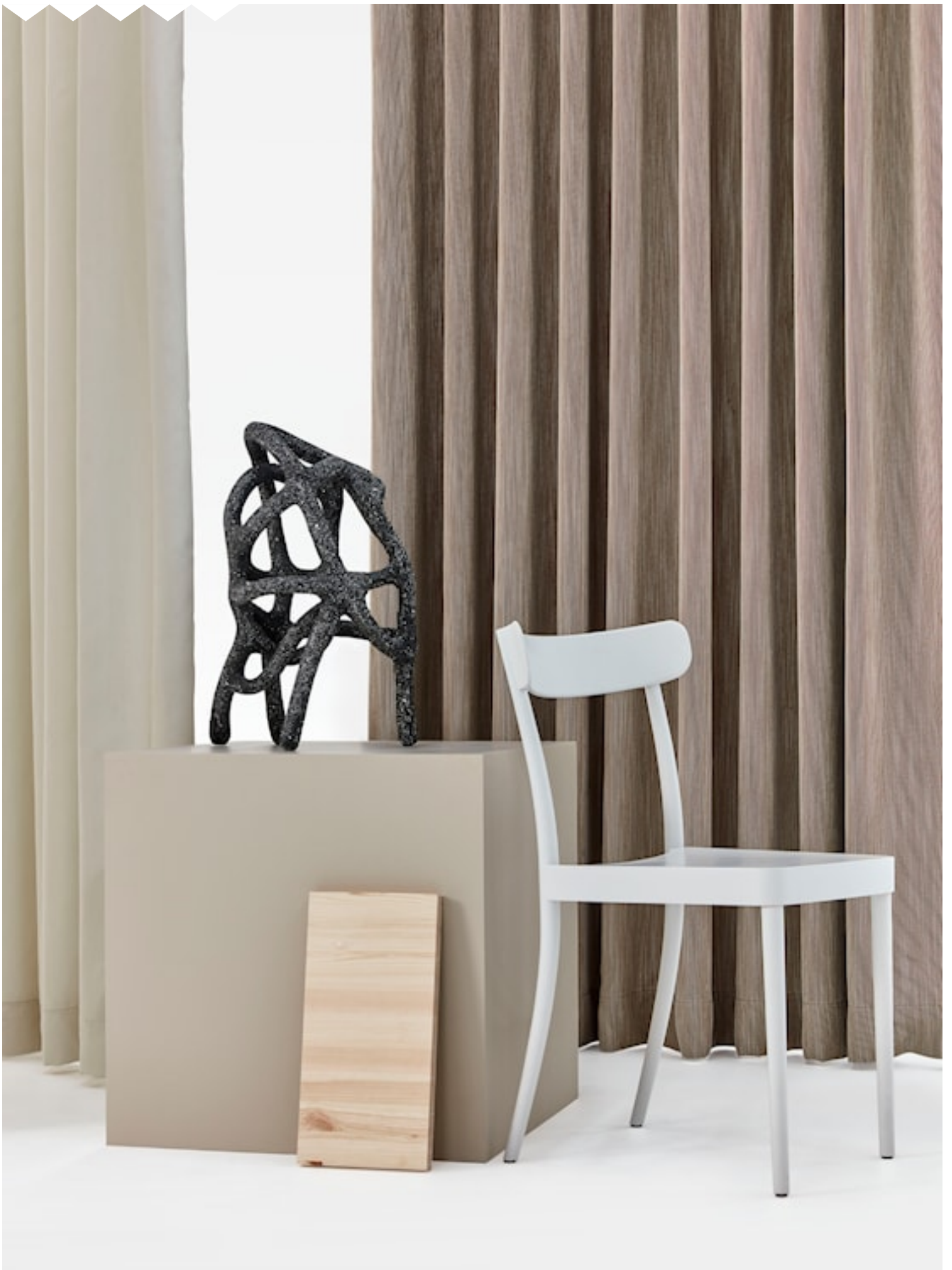
TWIN Hanging fabrics