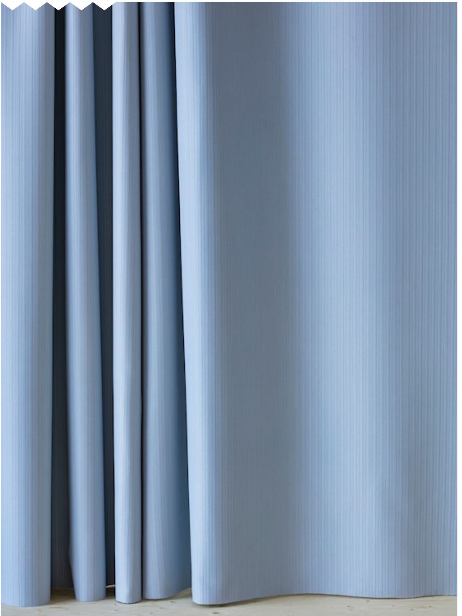
CALLA Hanging fabrics