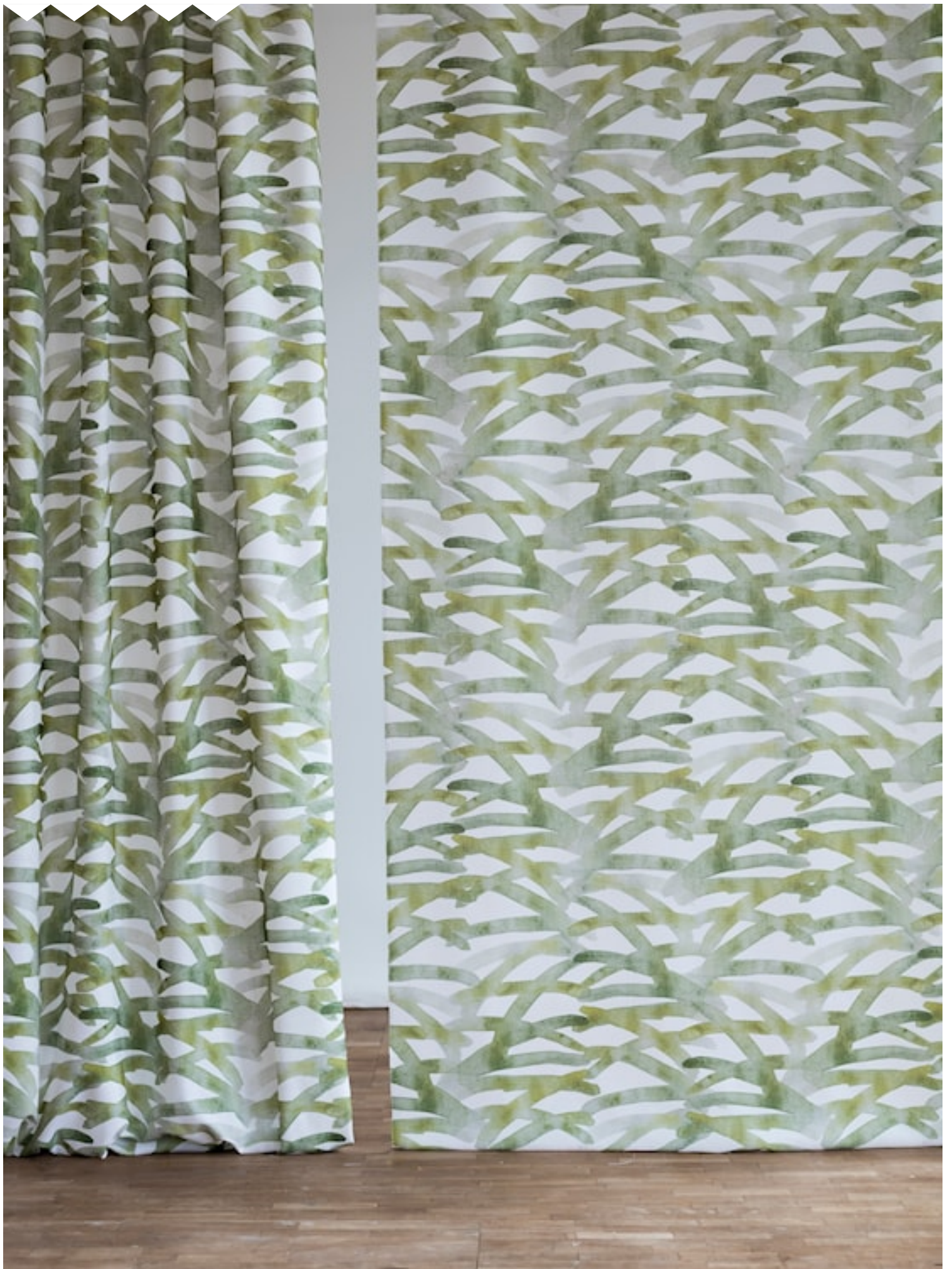
SAWA Hanging fabrics