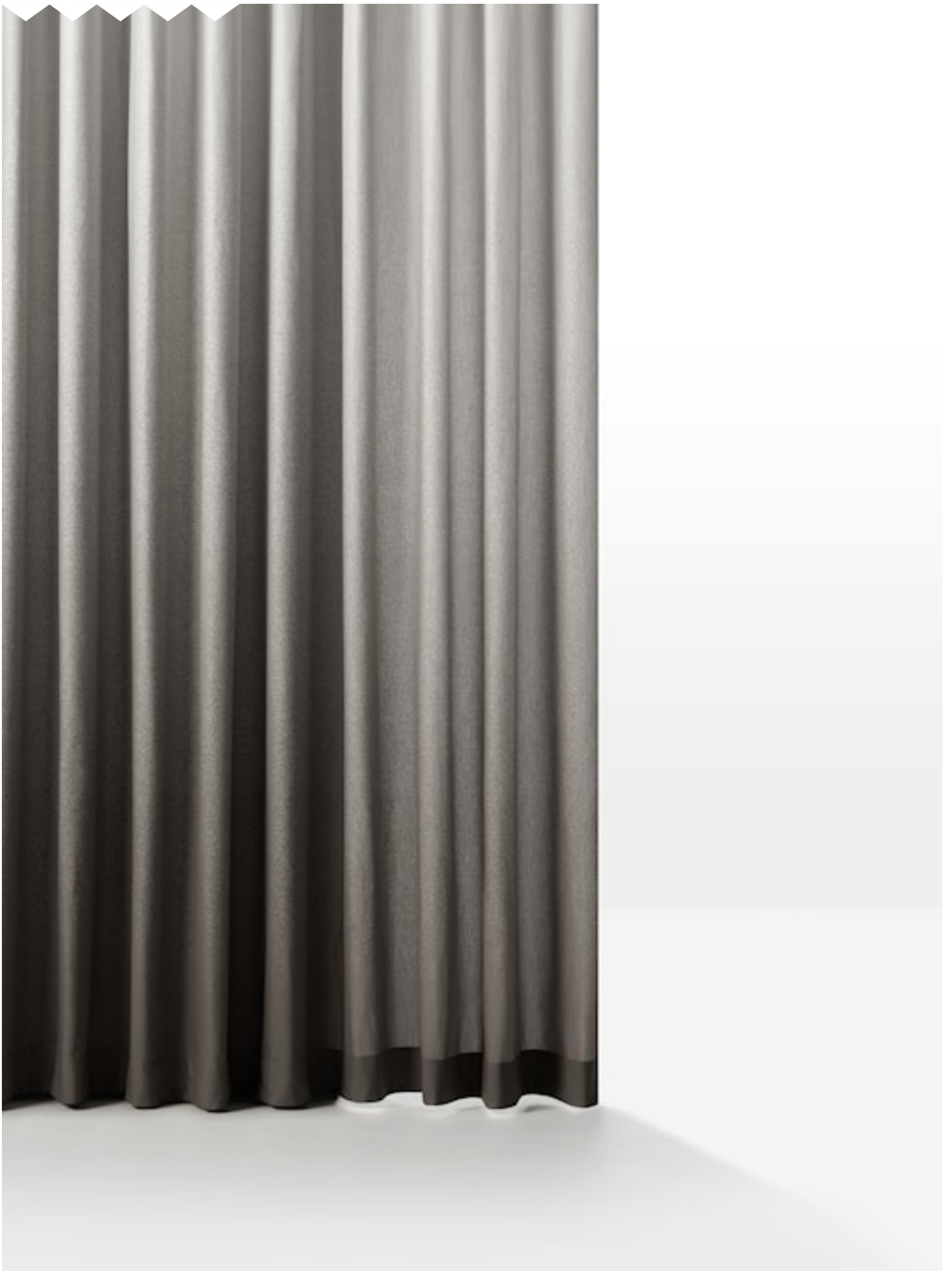
OMBRÉ 300 Hanging fabrics