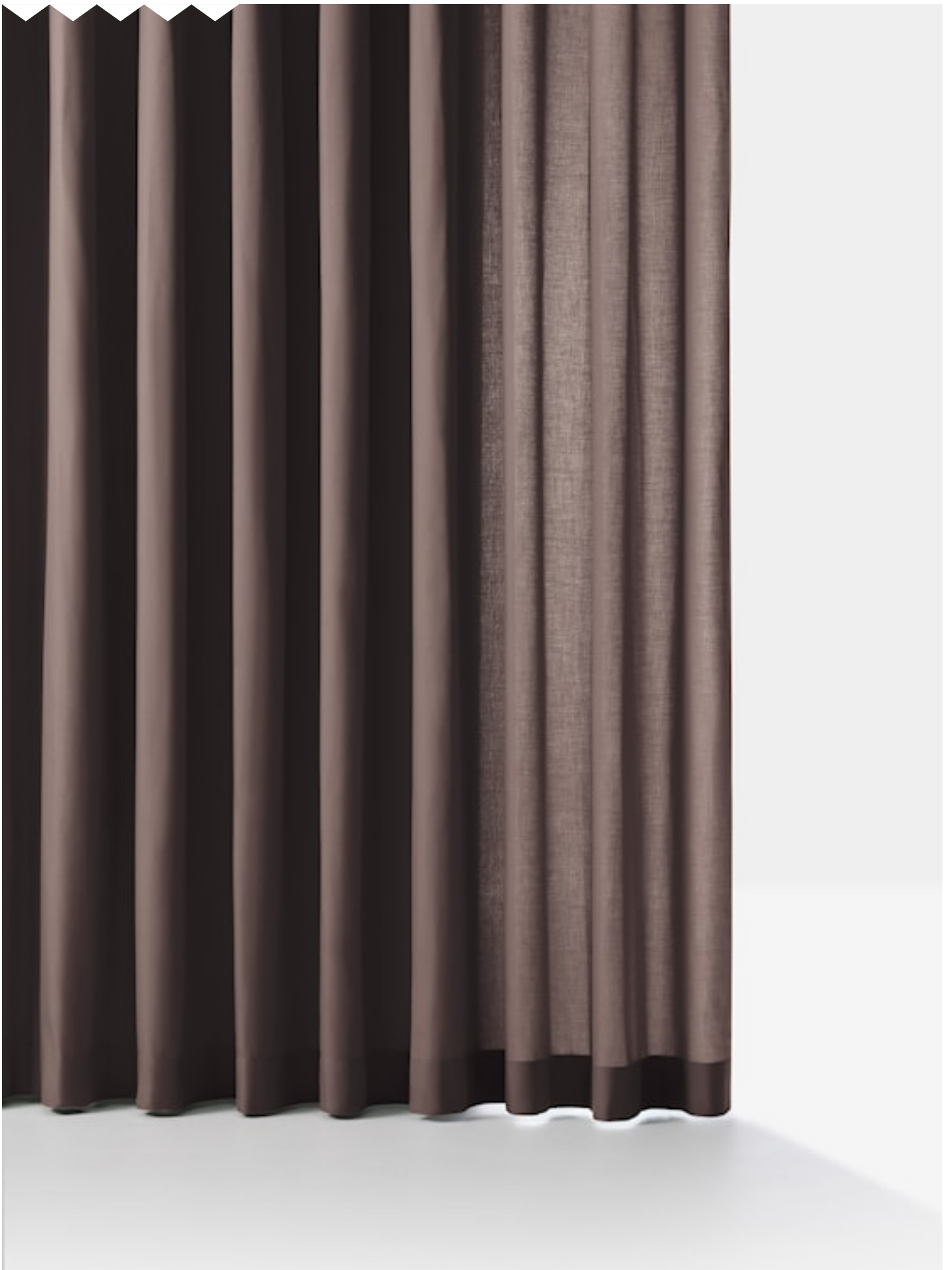
DITO Hanging fabrics