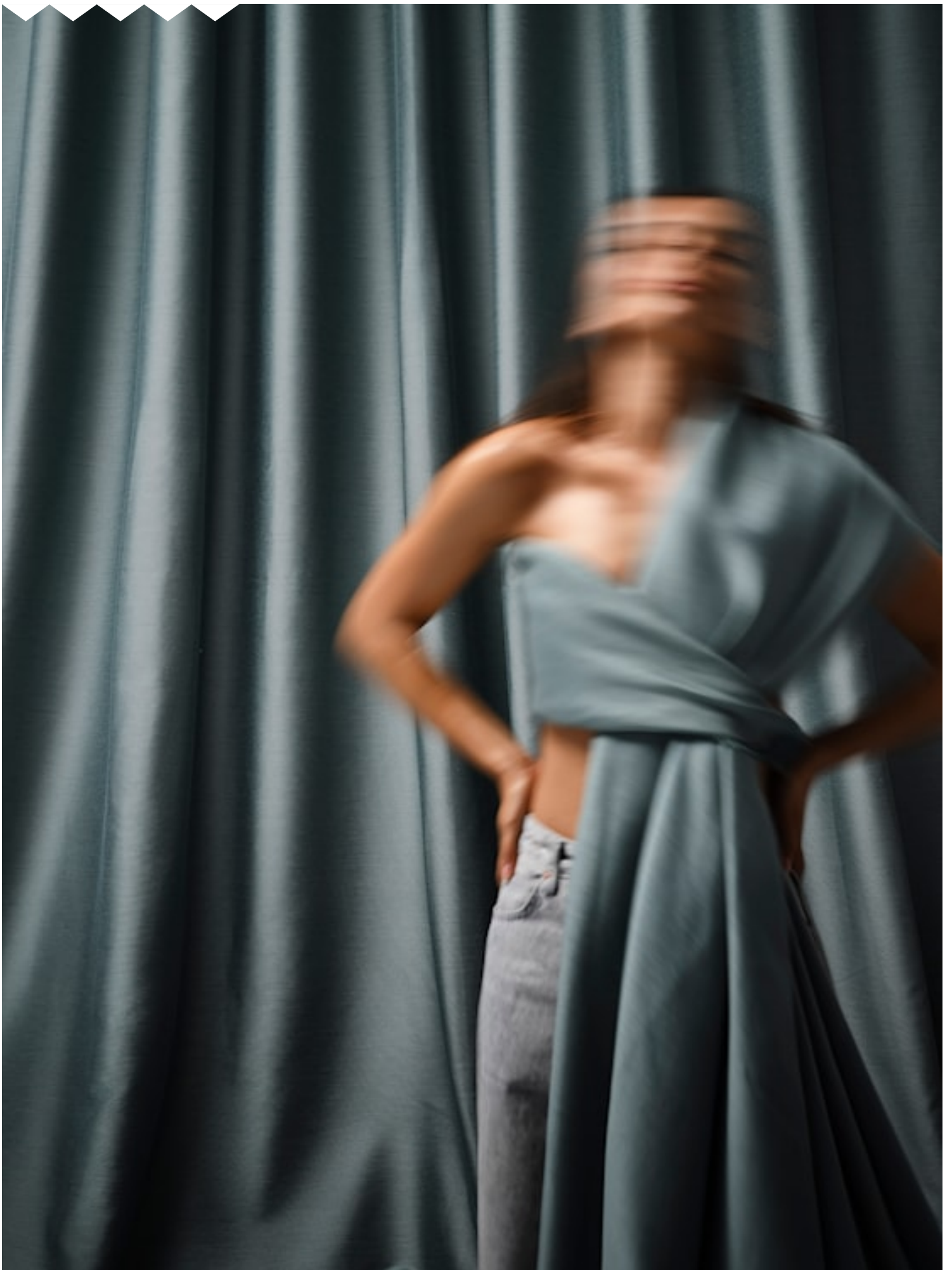
DUAL Hanging fabrics