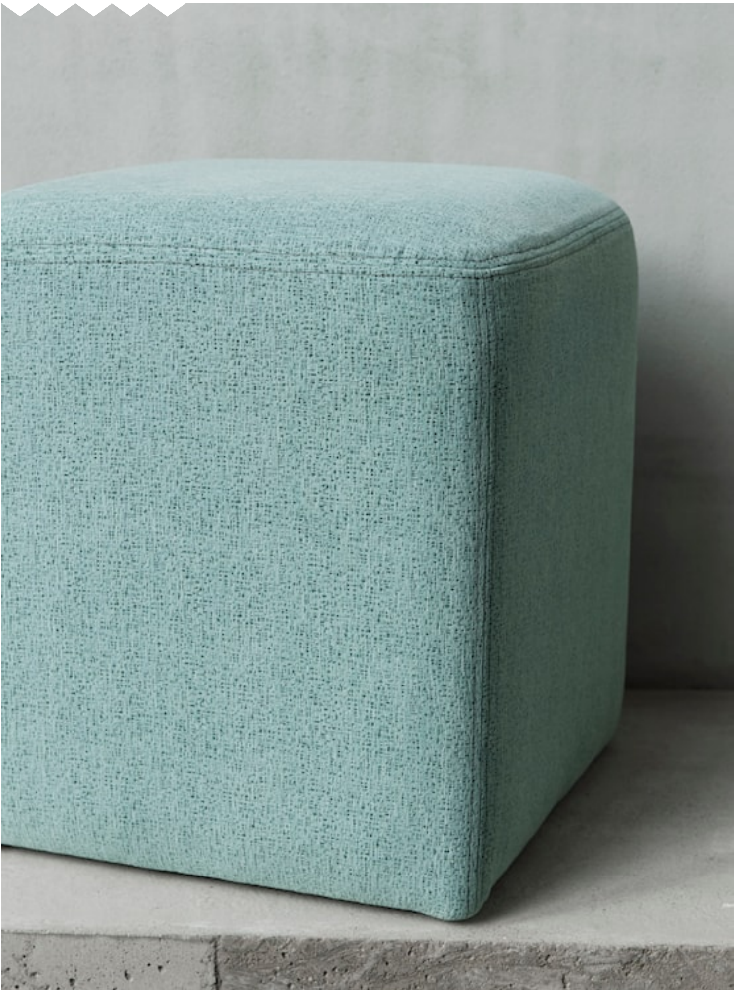
VELVET UNIT Upholstery fabrics