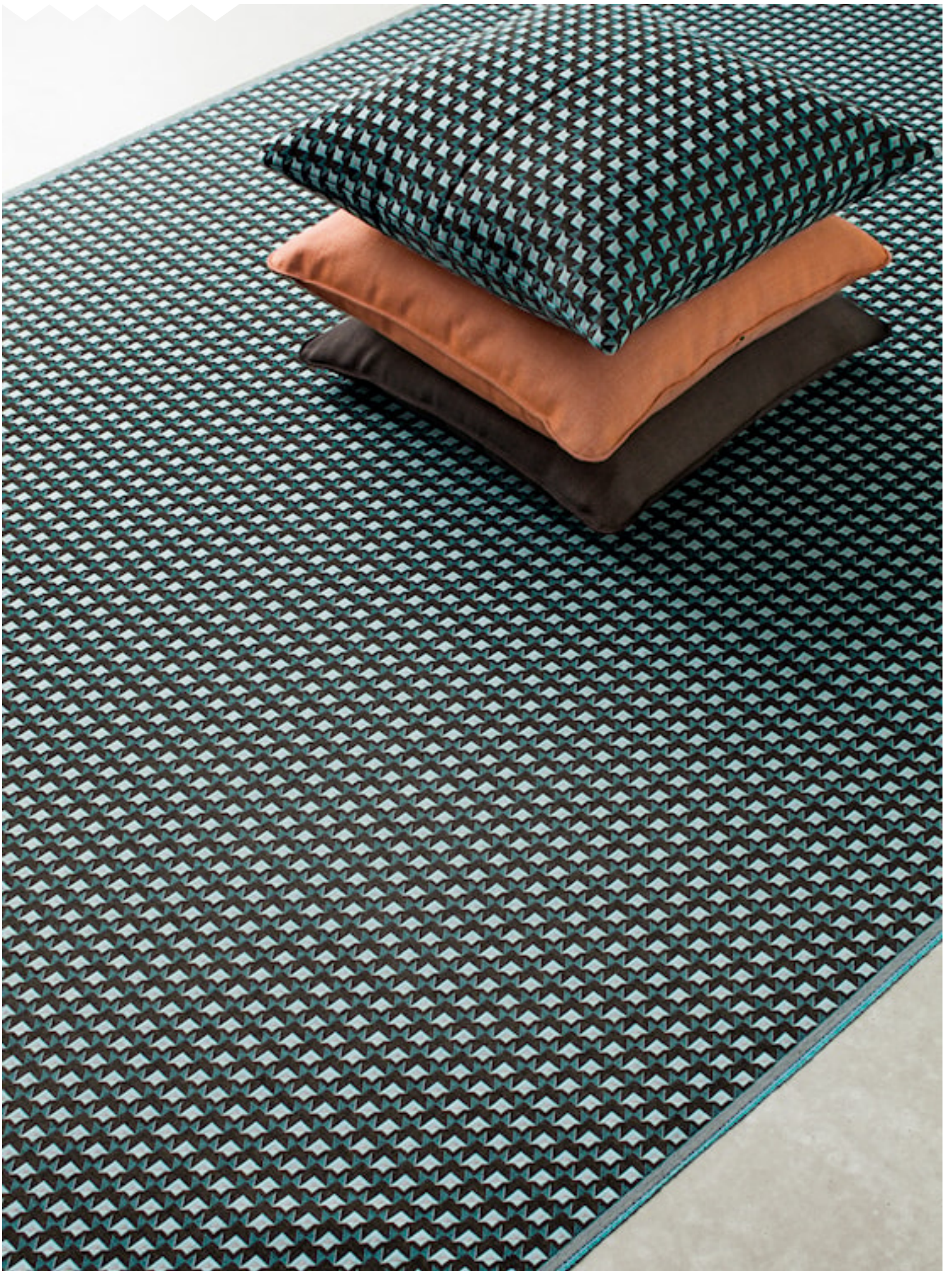
ACCESSOIRE BOK Upholstery fabrics